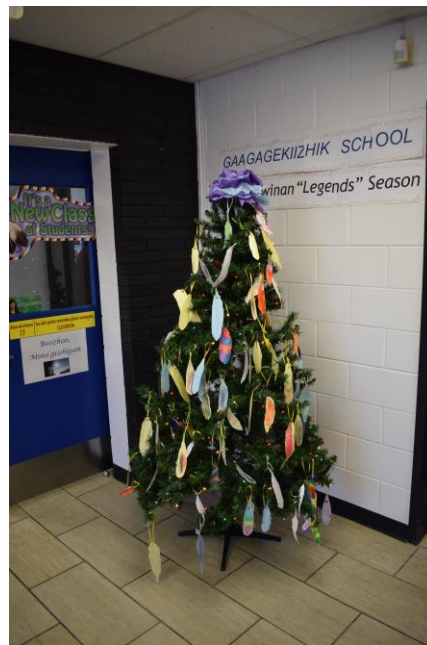
Spirit of giving trees that highlighted thankfulness and wishes for others.