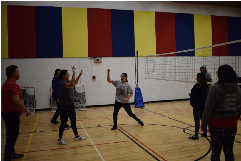
Students VS Staff Volleyball Game!