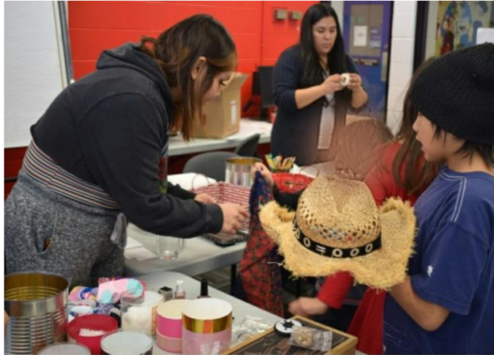
Giving Thanks Sale for students that was organized by the Bimose Staff and Students.