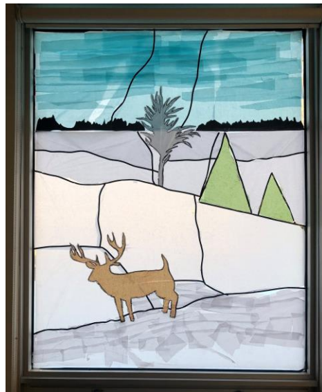
Grade 3/4 classroom window art.