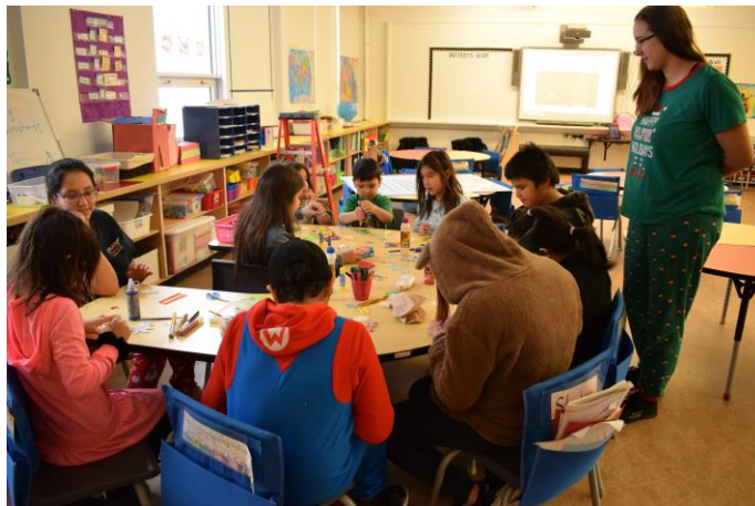
School wide PJ day/craft making afternoon. This was organized and facilitated by Bimose students.