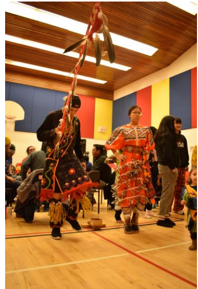
Gaagagekiizhik Winter Solstice feast and Niimi'diwin (Powwow)