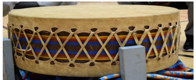
Our first 2019-2020 school year Anishinaabe niimi'idiwin , (Powwow).