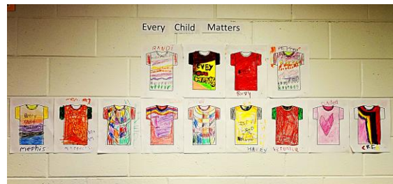
Grade 1/2 Classroom

We honored Orange T-Shirt with a prayer, a smudge and shared knowledge about the day.